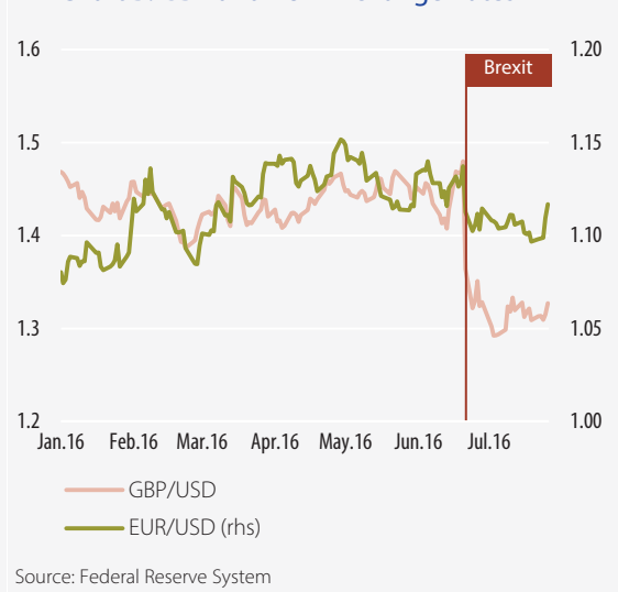
Chart B. GBP and EUR Exchange Rates

The immediate effects, that occurred amid the increase in risk aversion, referred to falls in the main stock exchange indices in Europe (Chart A) and the shift in some financial capital flows to safe haven countries, such as the USA or Switzerland, which triggered the substantial depreciation of the pound sterling and, to a lower extent, of the euro versus the major international currencies (Chart B). Although these evolutions saw a correction subsequently it is possible that they re-emerge in the future, depending on the manner negotiations are carried out during the separation process. No major adverse impact has been felt so far on financial markets in Romania.